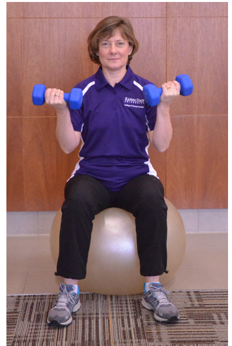
Bicep curl with weights and stability ball