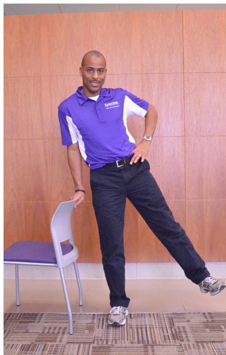
Side leg raises