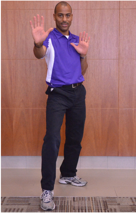
Forward toe-touch/arm reach