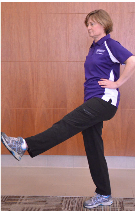
Front leg raises