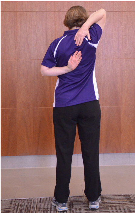
Upper arm stretch