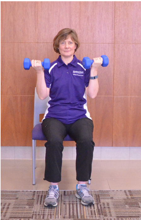
Bicep curl with free weights