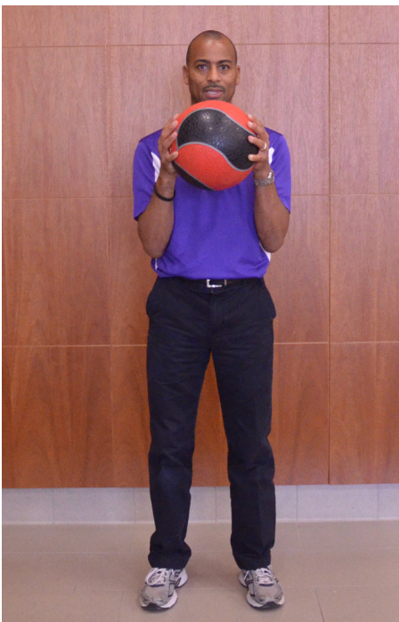
Bicep curl with medicine ball